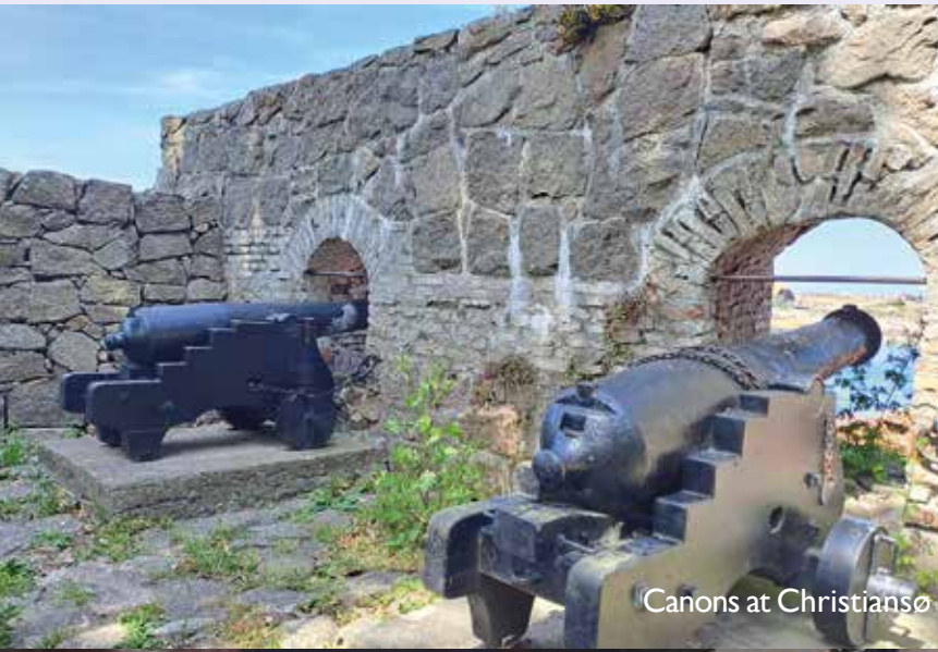
Canons at Christiansø