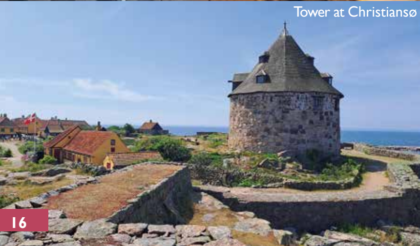
Tower at Christiansø

This rocky fortified mini-island, run by the Danish Ministry of Defence, covers just 55 acres, and was frequently the focus of wars between Denmark and arch-enemy Sweden due to its location on the main Baltic shipping routes. Surprisingly, to me at least, the main adversary in the 19th century was England: our ships attacked with relentless bombardments over a period of years but failed to conquer. That never featured in our school history lessons!