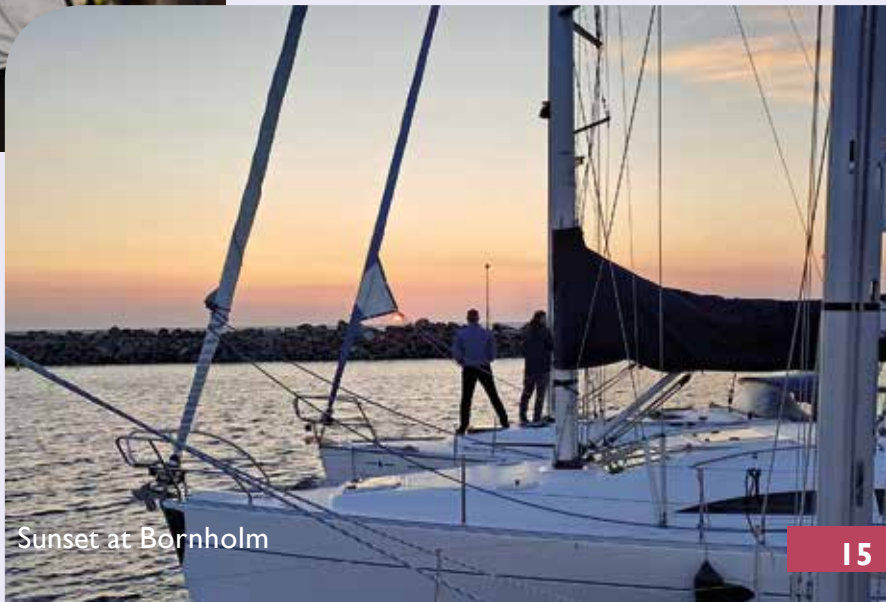
Sunset at Bornholm

strolling past tranquil beaches and spending a day on the neighbouring island of Christiansø. Confession: we went by ferry.