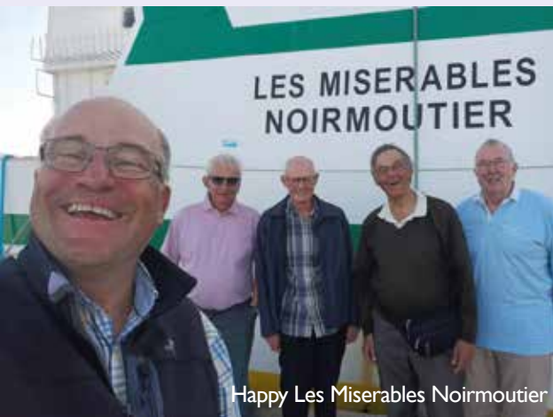
Happy Les Miserables Noirmoutier

Refer to our Facebook page and website ( www.channelsailing.org ) for updates and further details.