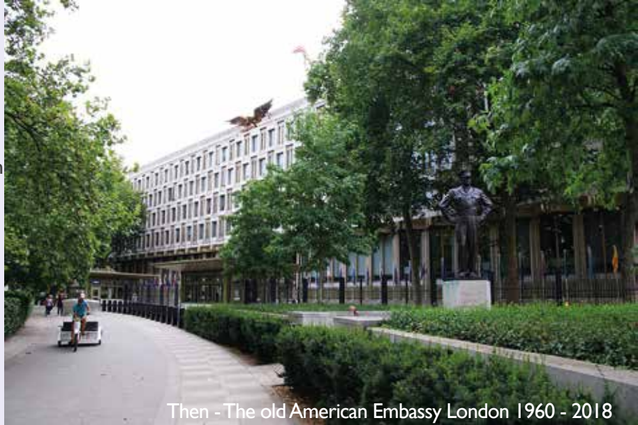
Then - The old American Embassy London 1960 - 2018