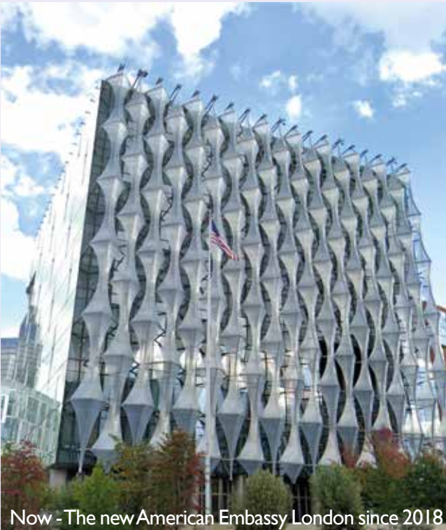
Now - The new American Embassy London since 2018

Thinking back from our present times, with memories of bombing of the Baghdad Embassy and the 9/11 Twin Towers attacks, it is almost impossible to imagine such a generous and casual invitation. Truly a world we have lost.