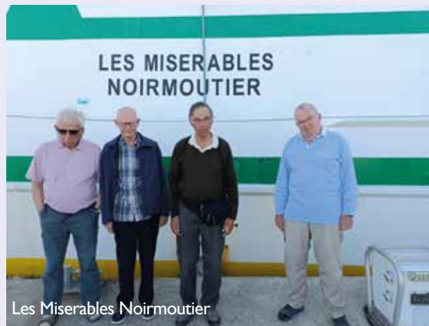
Les Miserables Noirmoutier