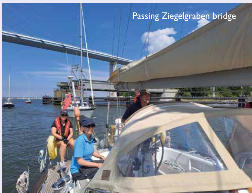
Passing Ziegelgraben bridge

We rounded the island in gentle winds to stop at the tiny village of Gager, a peaceful