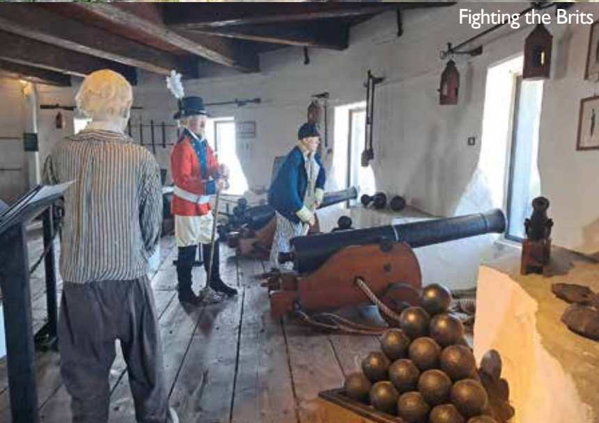
Fighting the Brits