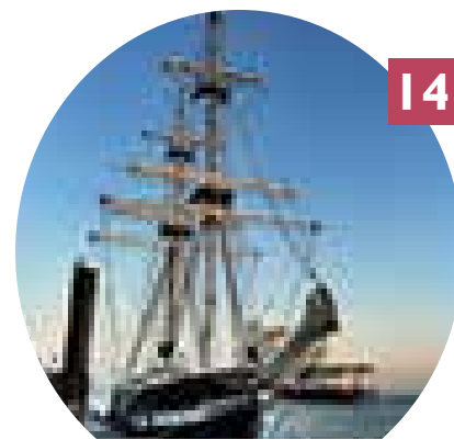
Tall Ship, Small Story