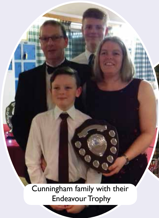
Cunningham family with their Endeavour Trophy