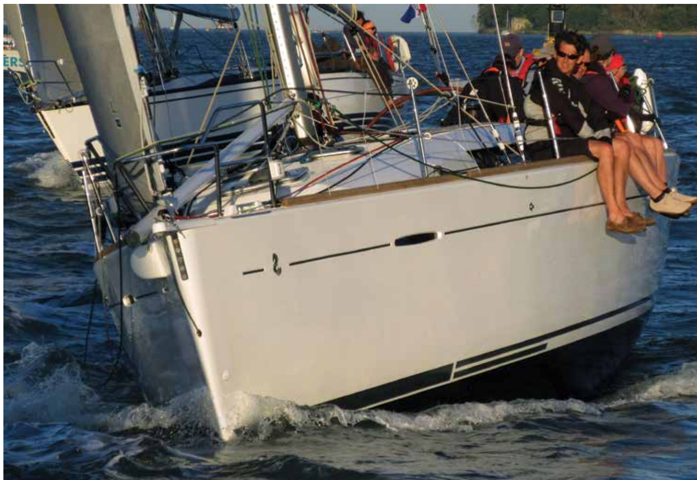
■ Merlin of Cowes, a Beneteau First 41, is booked for the Fastet Race 2017