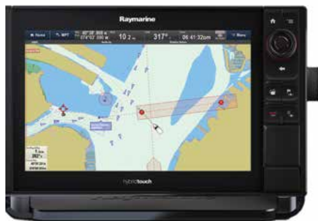
■ Top, the chart table area, and, middle, eS97 plotter repeater which will be permanently fitted in the cockpit, and, below, eS127 chart plotter with intuitive AIS which will be at the chart table