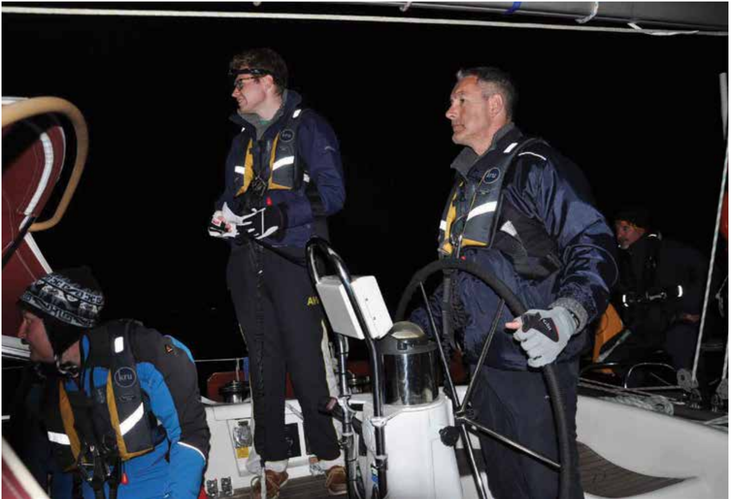
■ Above, night sailing on a Day Skipper course.