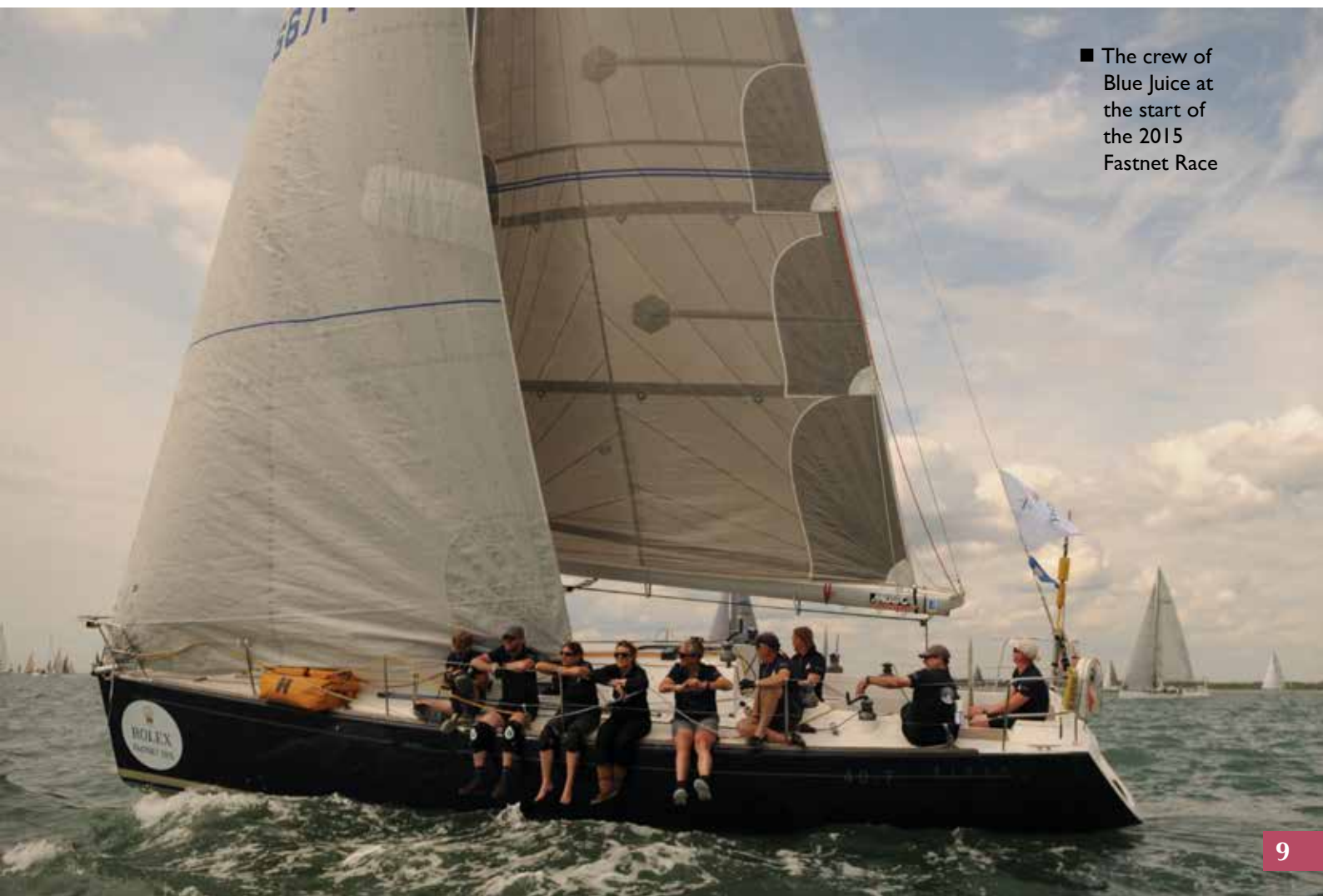
■ The crew of Blue Juice at the start of the 2015 Fastnet Race